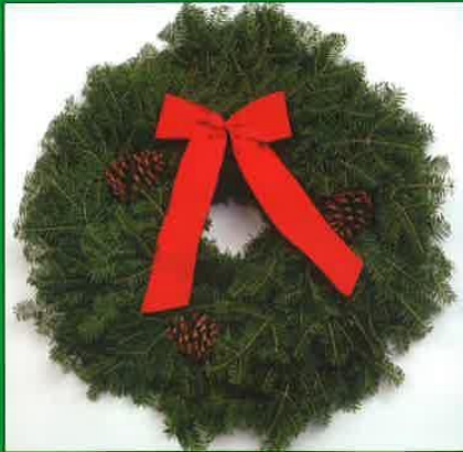
Single Face Balsam Outdoor Wreath 26", 36", 48", 60", 72" Double Face Balsam 36"