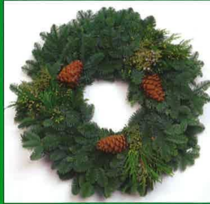
Noble Fir Mixed Wreath 20", 36" & 48" Indoor/Outdoor