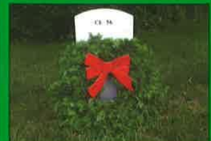
Fallen Hero Wreath Delivered to a National Cemetery