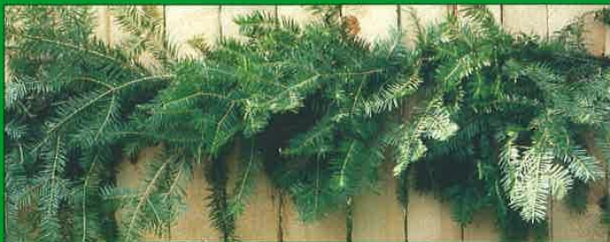
25' Balsam Fir Garland Mixed Cedar & Noble also Available