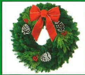
24" Boxed Decorator Wreath