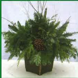
Evergreen Planter Regular 32" Supersized 38"