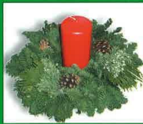
12" Candle Ring Wreath with 4" Candle