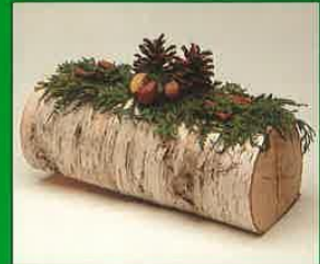
Holiday Yule Log 12"